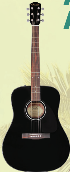
CD-60 H70152 Spruce Top, Mahogany Back and Sides, with Case

Available in Black, Natural and Sunburst