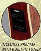
INCLUDES PREAMP WITH BUILT-IN TUNER