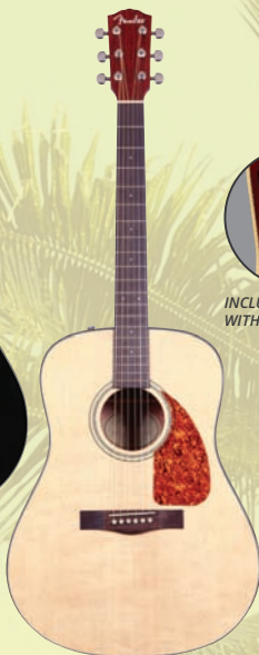
CD-140S H70156 Solid Spruce Top, Mahogany Back and Sides