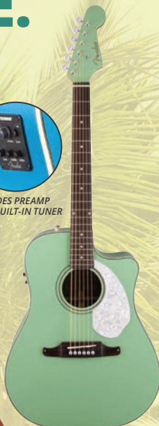
SONORAN™ SCE Solid Spruce Top, Mahogany Back and Sides

Available in Natural, Black, Candy Apple Red and Lake Placid Blue — H78859