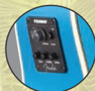
INCLUDES PREAMP WITH BUILT-IN TUNER