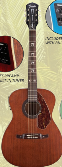
TIM ARMSTRONG HELLCAT 580406 Solid Spruce Top, Mahogany Back and Sides